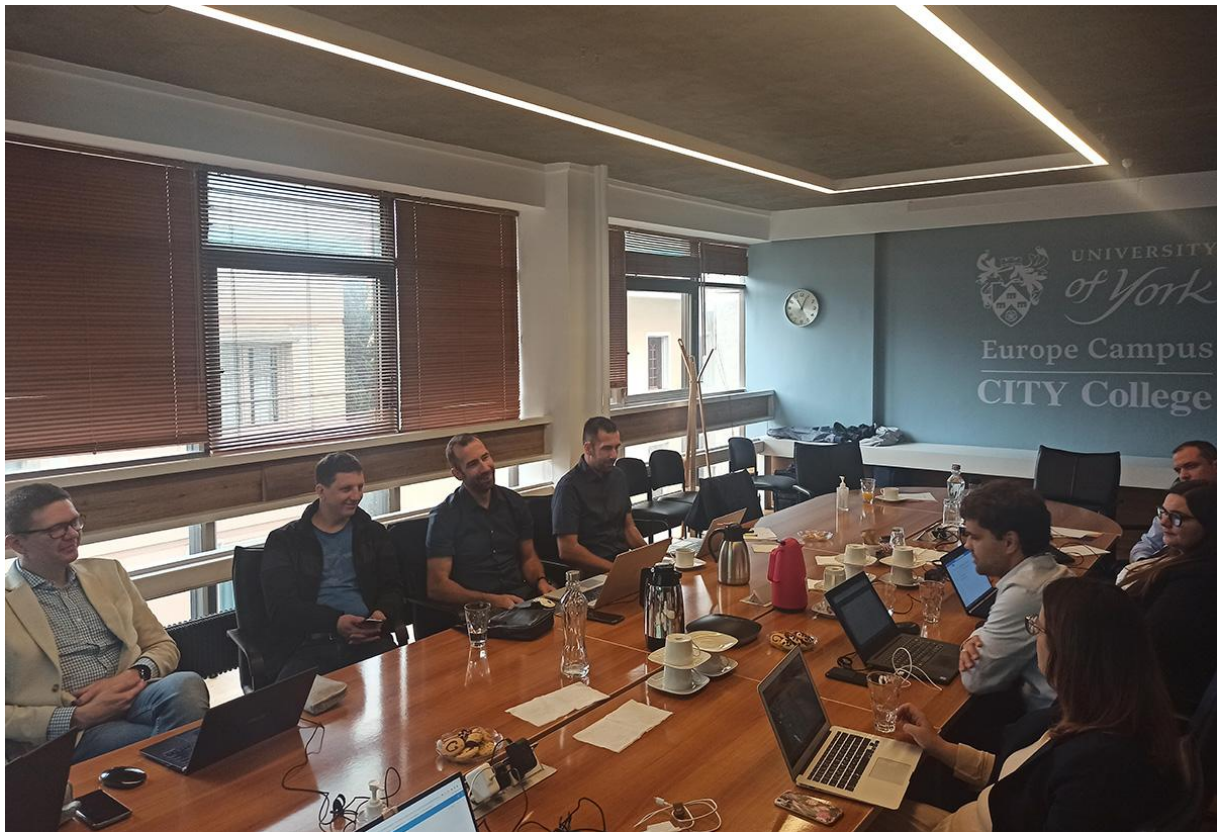
Image 2. The NEXTLOG partners during the Thessaloniki TPM meeting.