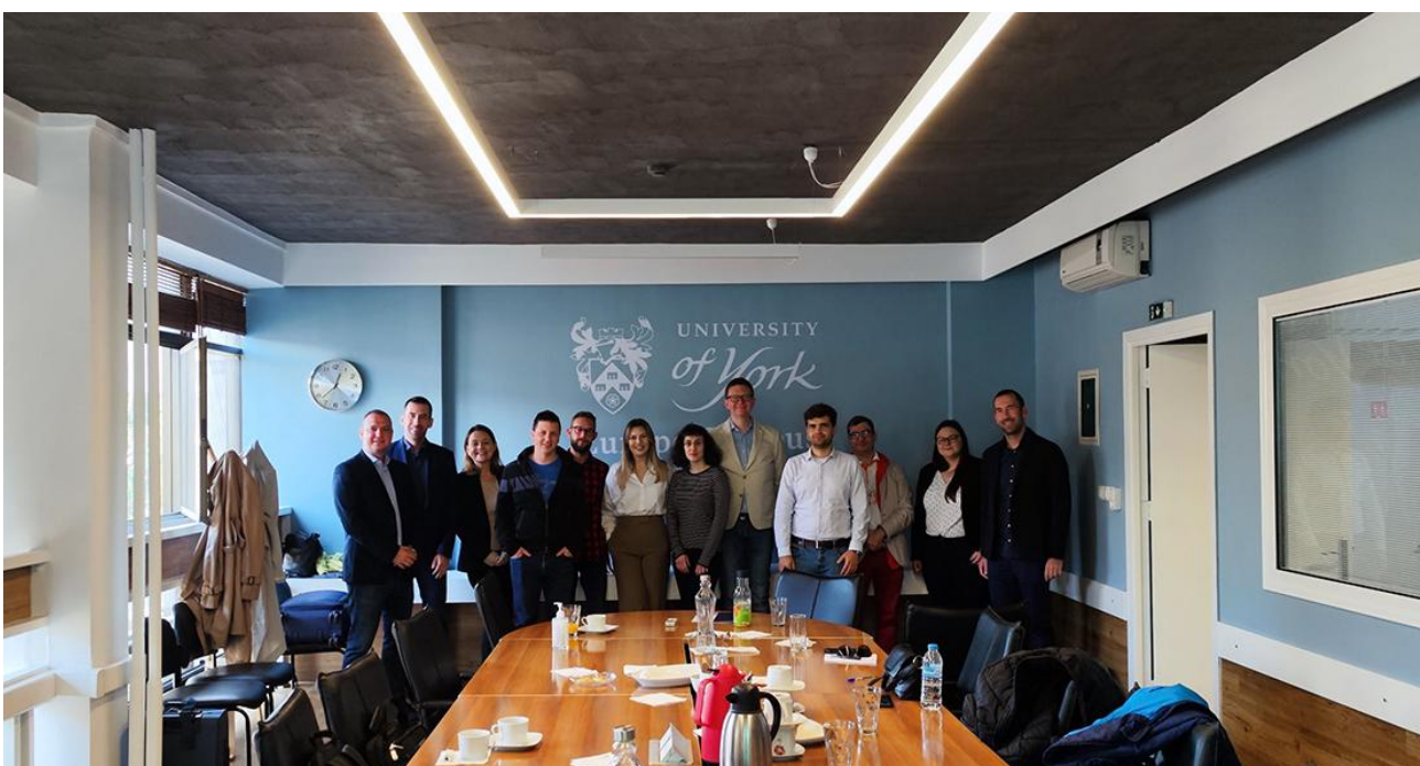
Image 1. The NEXTLOG partners in the Thessaloniki TPM.

The videos of the e-learning environment will also be developed by each partner. The partners have also discussed the remaining multiplier events that were scheduled for the month of November 2022.