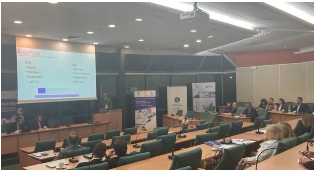
Image 3. Participation of UoL in the "Responsible Supply Chains conference" in Torun, 2022.